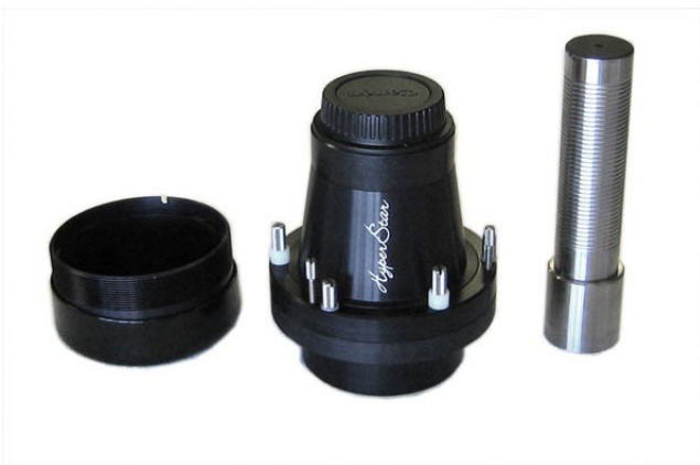
Secondary holder (shipped attached to lens), HyperStar lens, and counterweight