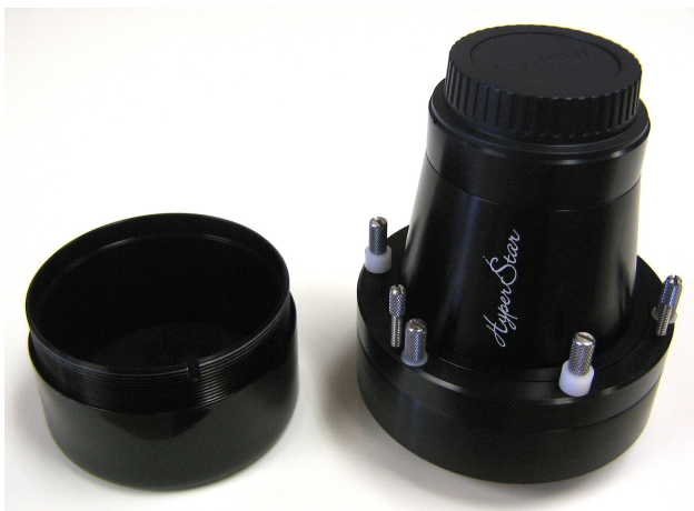
Secondary holder (shipped attached to lens) & HyperStar lens