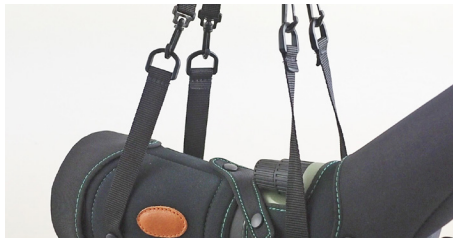
Repeat this process at the rear of the scope.

Need more help? Scan the QR code opposite or visit our Youtube channel for an instructional video.