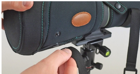
Repeat this process with the other strap (F) on to both sides of part (A).