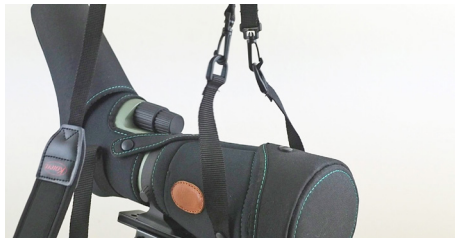
Connect main strap (G) to straps (F) with both clips on either side of the front of the scope.