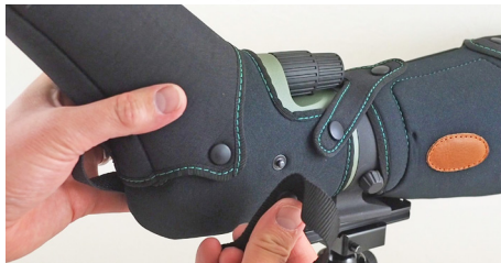
Attach strap (F) to both sides of part (B) using the press studs.